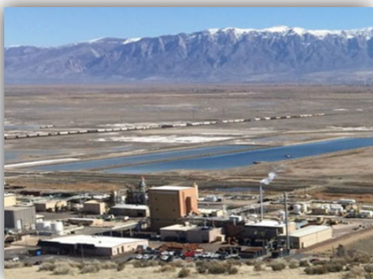
Situated near Utah's Great Salt Lake, the Western Zirconium plant is seen here in the foreground of the Wasatch Mountain Range.

Since 1978, the Western Zirconium metal production facility located in Ogden, Utah has provided Zirconium and Hafnium-related products for nuclear power and other industrial uses like medical, aerospace, oil and gas, petrochemicals, and electronics. Guided by the policies and regulations that apply to global nuclear energy generation, the WZ facility operates within regulated quality compliance and requirements.