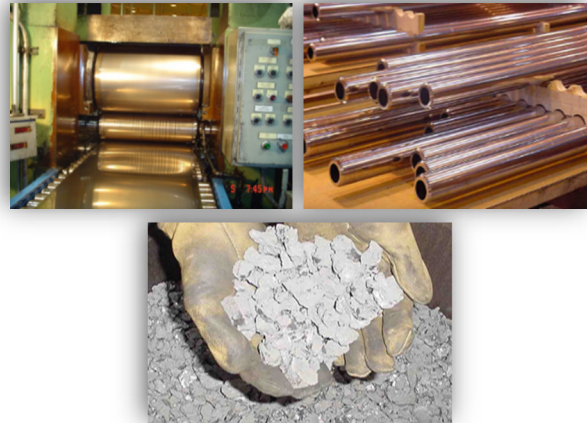
Zirconium being produced as flat strip coil (top left), TREX for tubing applications (top right), and hafnium sponge (bottom).

As a full-service metals production facility, Western Zirconium can forge and extrude our zirconium in addition to melting. The resulting high-purity Zr is available in a range of product types: flat strip coil, TREX tubing, bar (extrusions) and plate for structural applications. For processing and alloying, our Zr is also available in the forms of Sponge and Fines.