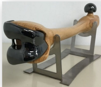
An example model of a zirconium knee replacement and femur ball joint

As medical technology continues to astound and advance human well-being, the prospects for even greater achievement continues. Western Zirconium's specialty metals are enabling stronger, longer-lasting human joint replacement devices.