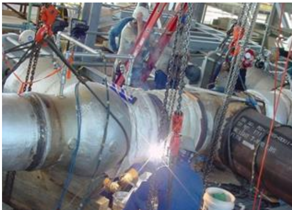
Piping and component replacement at a power plant

Our portfolio of welding project successes includes new construction, plant modifications, emergency service and planned outage maintenance. We serve the oil and gas industry, particularly the petrochemical and production/midstream segments. We also have experience serving engineering, procurement and construction (EPC) entities and end users in food and beverage processing.